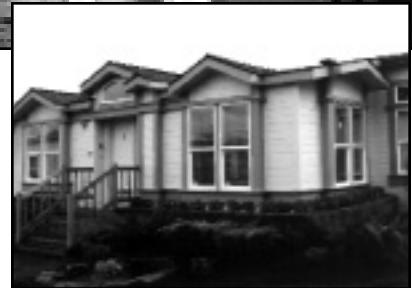
According to Silvercrest, the new Manor Series can now be easily mainstreamed into the $250,000 price-range neighborhoods on the West Coast.