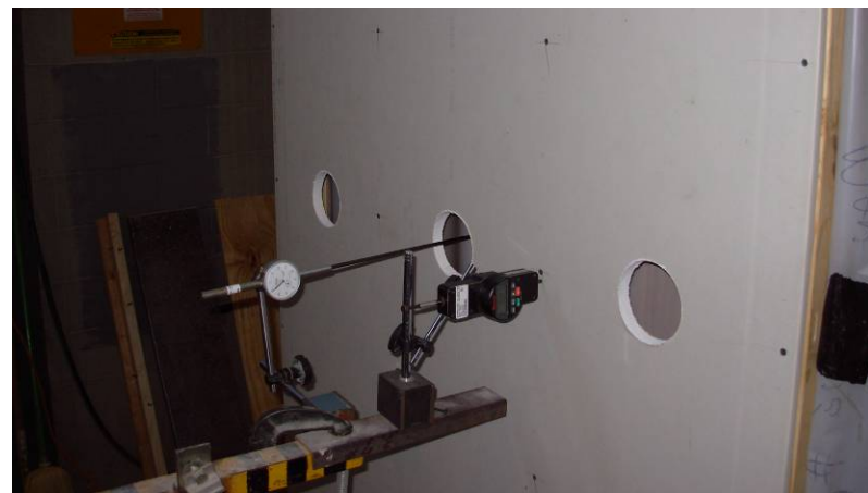
Gage locations on test wall assembly. One gage on back of wall assembly and one gage on back of plywood/eXP® sheathing