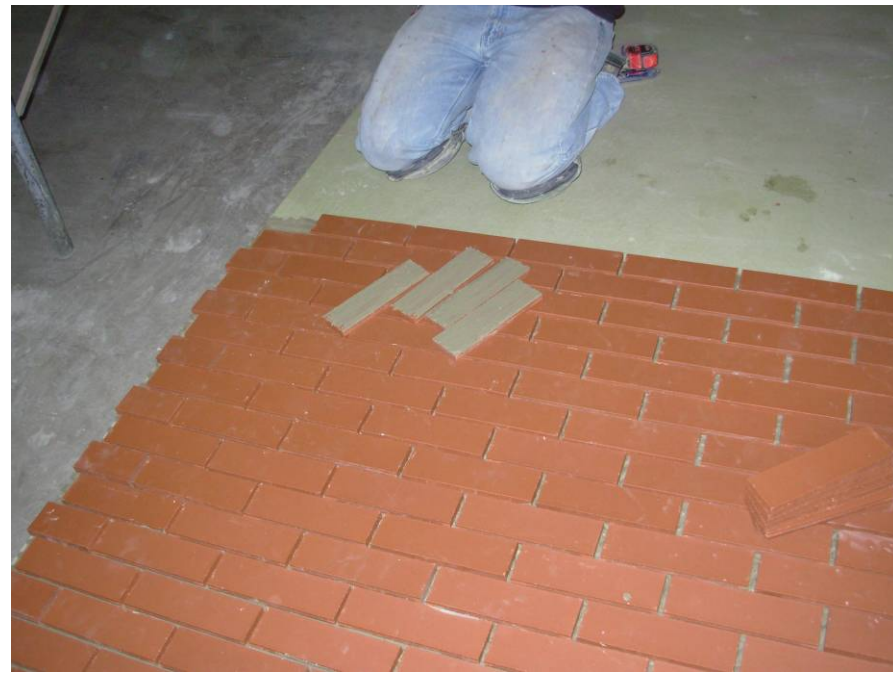
Masonry application on to test frame