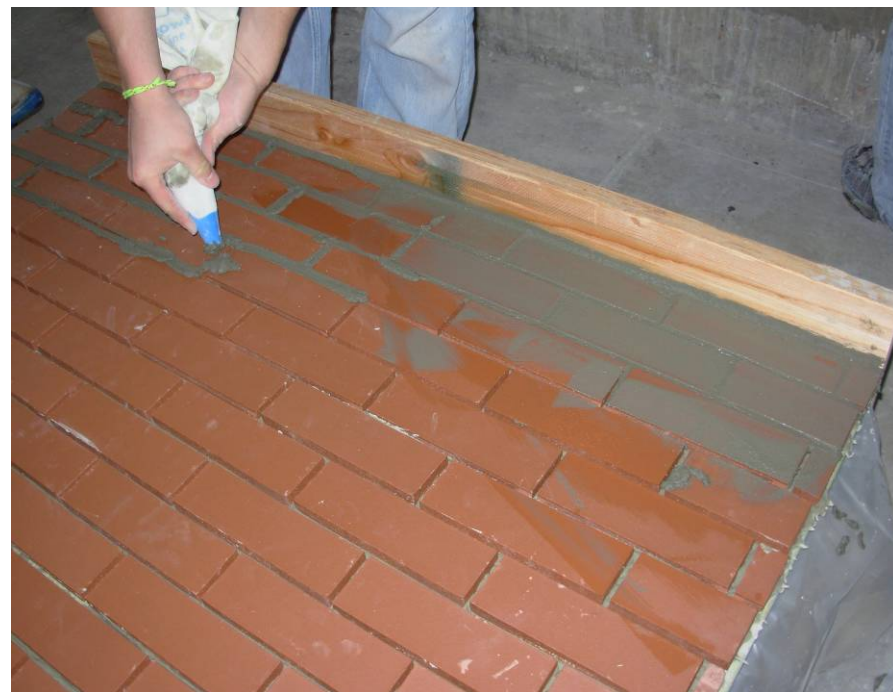
Grouting of masonry units