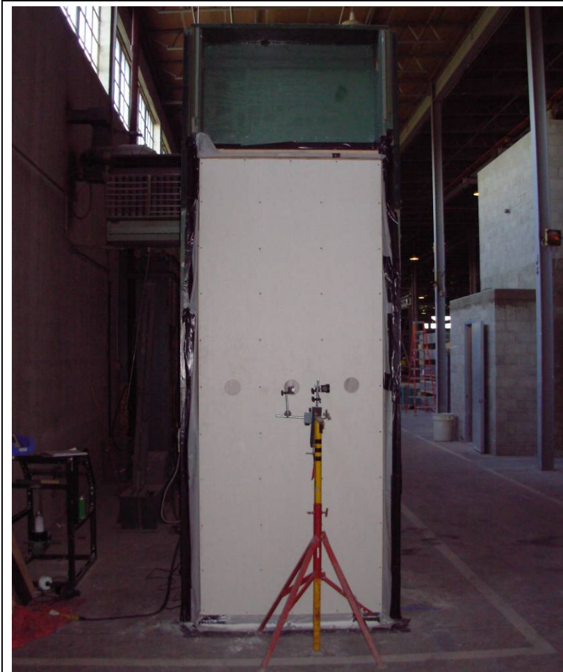
Structural performance test frame with wall assembly installed